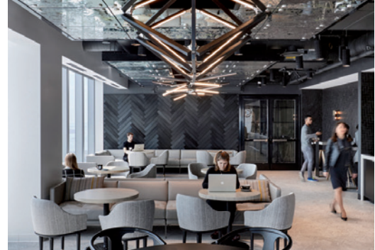
WELL& BY DURST AMENITY SPACE