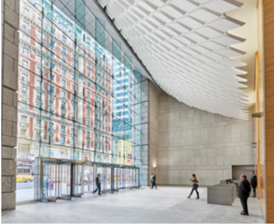
42 ND STREET LOBBY

ENTIRE FLOORS 34-38 34,154 - 34,185 SF EACH