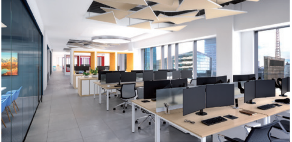
OPEN WORKSPACE - ARTIST RENDERING