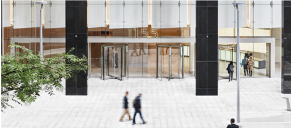
PLAZA & ENTRANCE