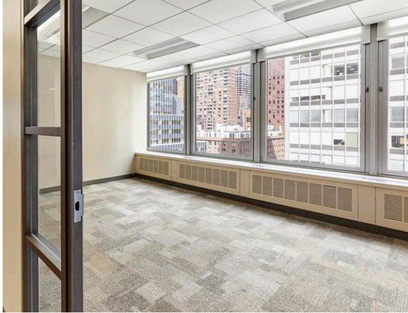
PERIMETER PRIVATE OFFICE