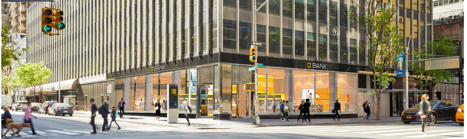
4,006 SF GROUND FLOOR CORNER RETAIL OPPORTUNITY