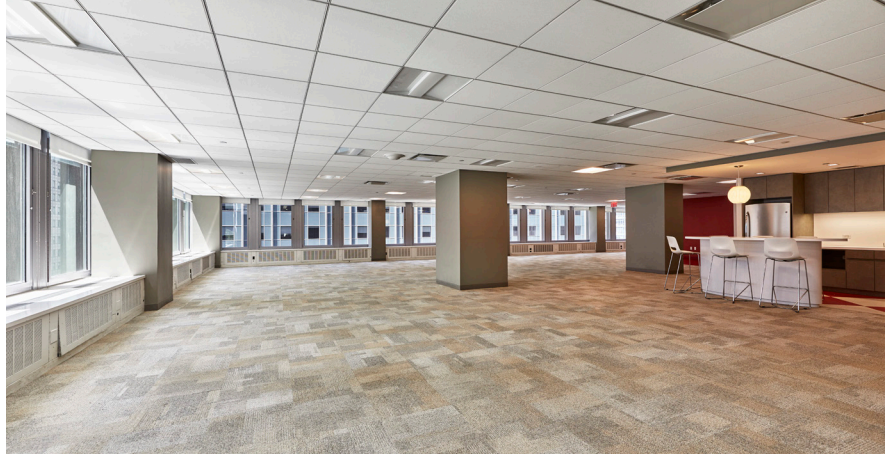
OPEN WORK AREA WITH PANTRY