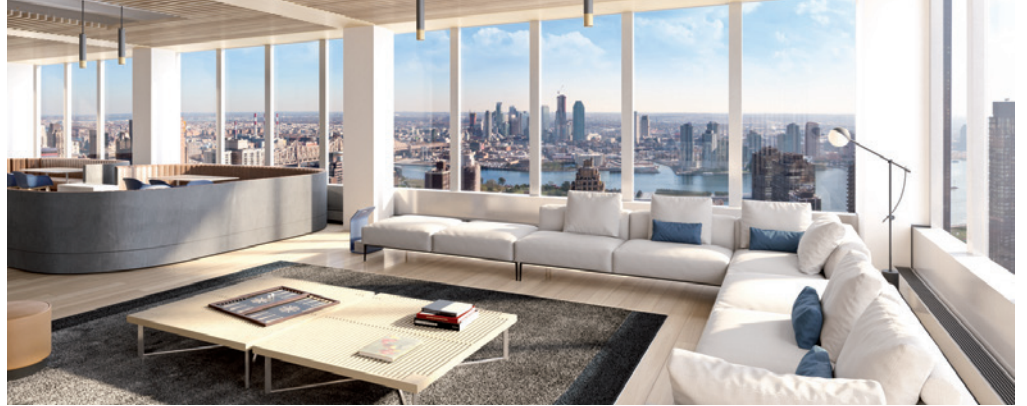
TOP OF HOUSE LOUNGE