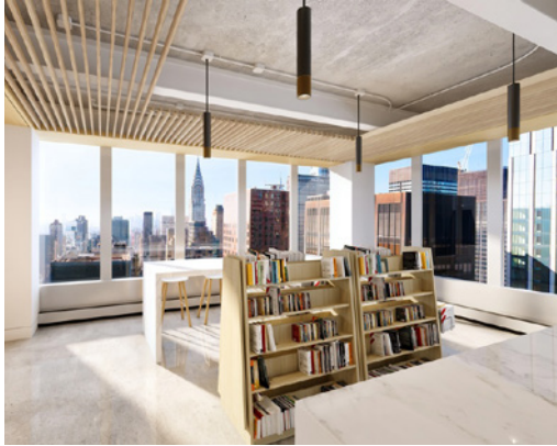
OPEN WORK LIBRARY