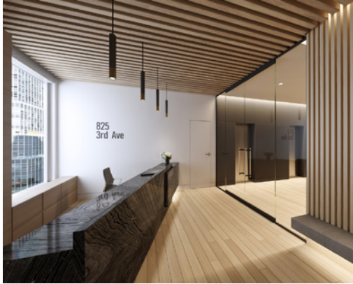
TENANT ELEVATOR LOBBY