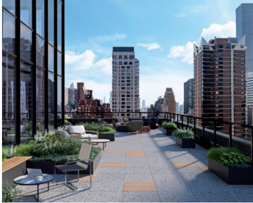
12TH FLOOR TERRACE