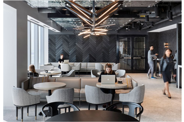
WELL & BY DURST AMENITY SPACE