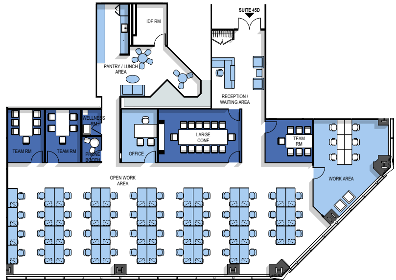
View of NY Harbor

CLICK HERE FOR ALL ONE WORLD TRADE CENTER AVAILABILITIES