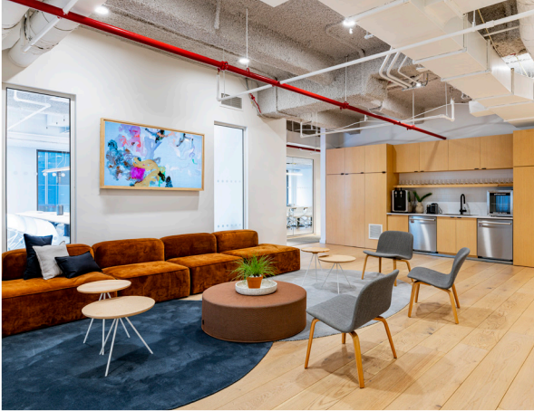
LOUNGE & KITCHEN