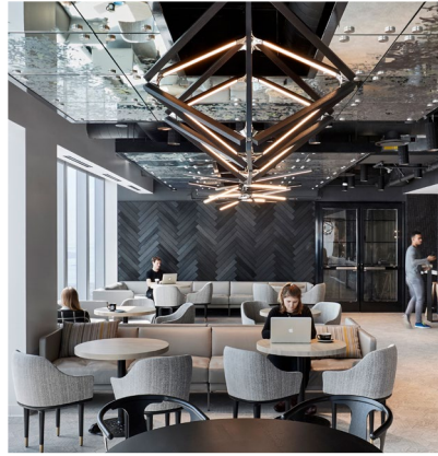
WELL & BY DURST AMENITY SPACE