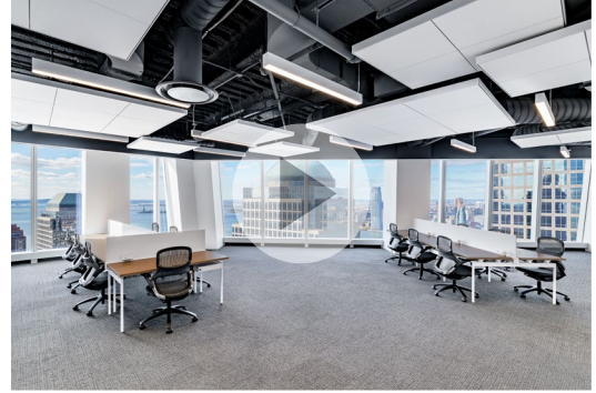
TAKE A VIRTUAL TOUR